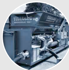
VARIO MOBILE EMERGENCY FEEDING TEST MACHINE