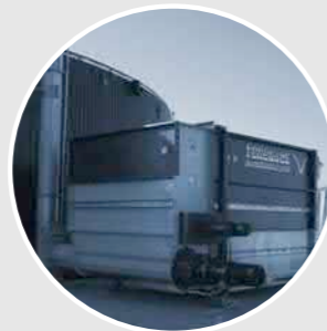
VARIO COMPACT FOR SMALL APPLICATION