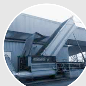
VARIO TRUCK ACCEPTANCE ALSO FOR SPECIAL SOLUTIONS WE ARE YOUR RIGHT PARTNER